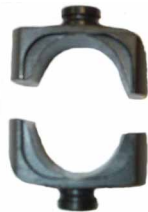
For WH2&WH3 Presses

New & Used Dies are available for all your crimping needs!